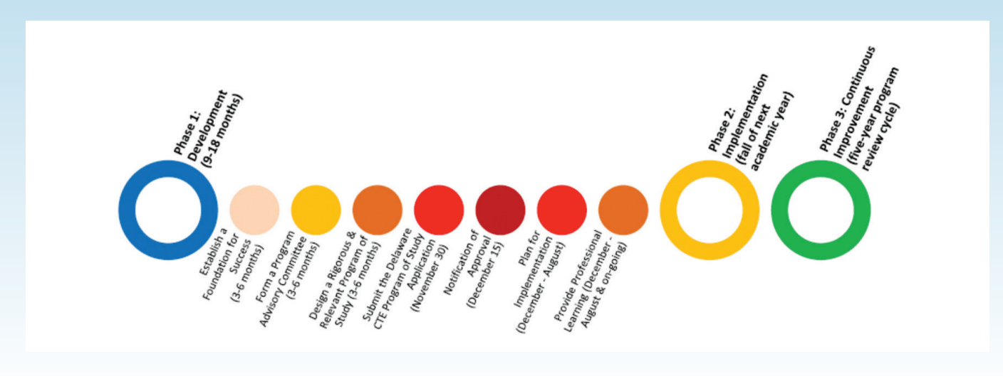
Figure 3: The life cycle of program of study approval in Delaware