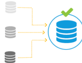
Pull data from multiple systems in real time

The Splunk Enterprise Architect will own the centralized ACCS enterprise Splunk install. This installation will be maintained and progressed to meet the requirements set forth by the Information Security Office. The position will encompass Linux administration, Splunk administration, as well as functional cybersecurity taskings.